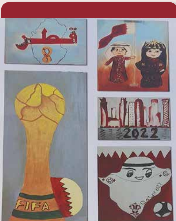
Shafallah associates mural