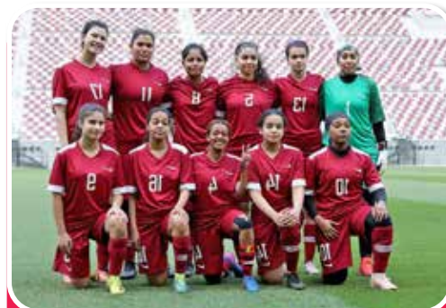
Supporting messages for Al-Adaam football's stars

La'eeb ... The official mascot of FIFA World Cup 2022 Qatar