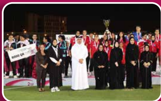
A world cup atmosphere in the GCC Academies Championship