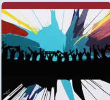
painted by artist : Fatima Al Nuaimi