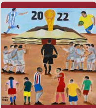
painted by artist : Saadia Abdul-Samad