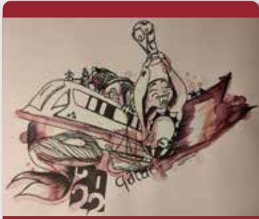
painted by artist : Bakhyta Al-Sada