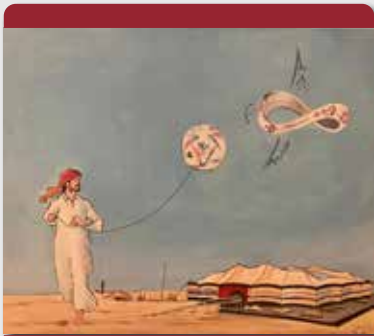
painted by artist : Sheikha Al-Kuwari