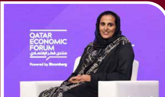
World Cup will shed light of the cultural diversity of Qatar's society : Sheikha Al-Mayassa