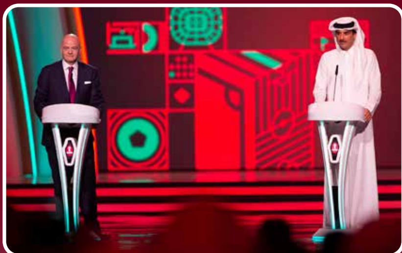
HH, The Amir: You are all welcome at World Cup 2022

Issue No.13, November 2022 Sport Magazine issued by Qatar Women's Sports Committee - Doha