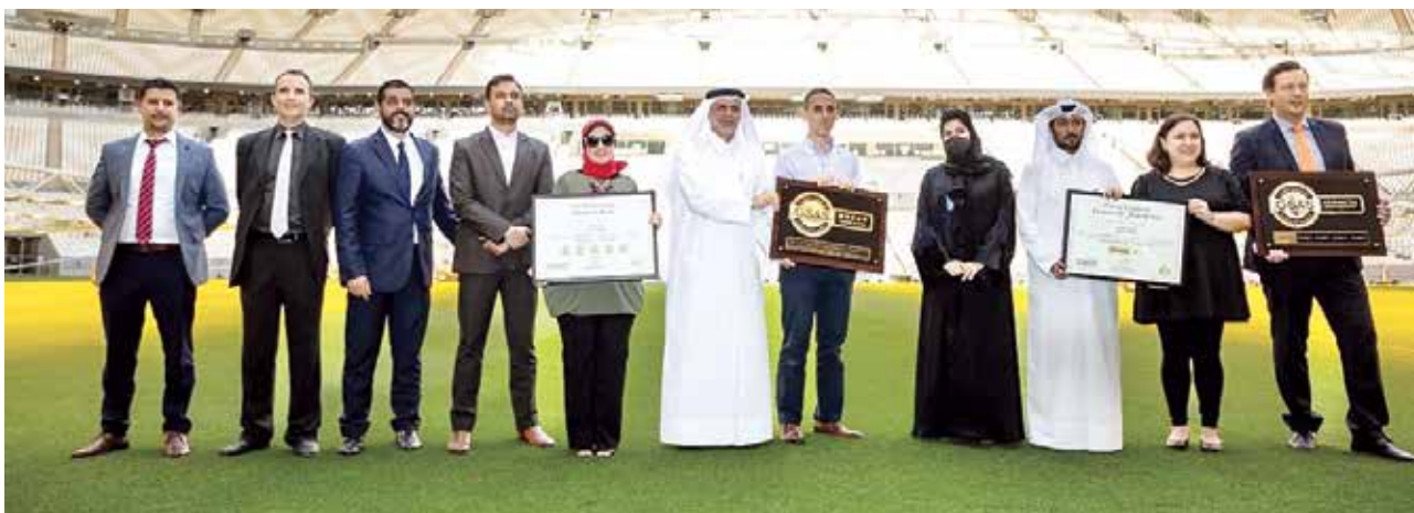
Using solar energy to run stadiums