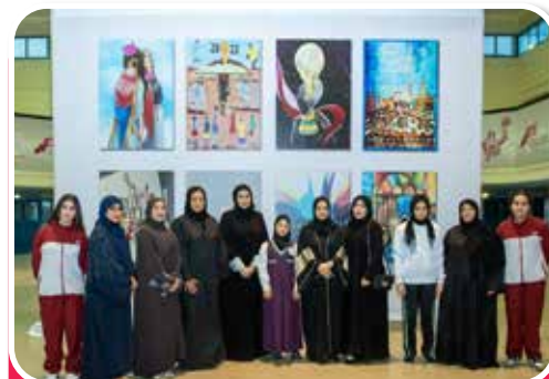
Women's Sports Committee Inaugurates FIFA World Cup Qatar 2022 Mural