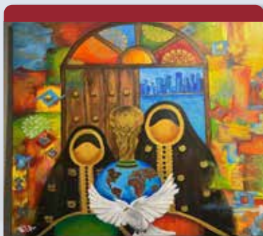
painted by artist : Mona Al-Sada